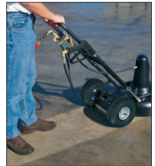
The Water Jet attaches to a hot or cold water pressure washer and cleans flat surfaces fast using a water-propelled spray bar that spins at 2000 RPM