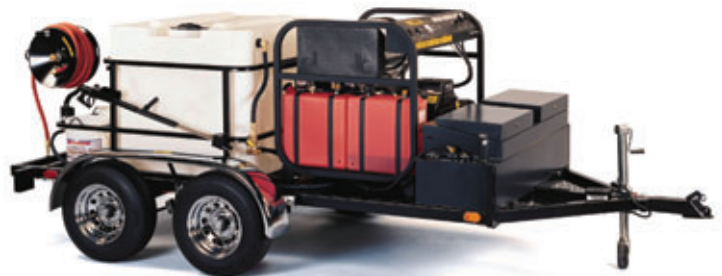
TR-6000 double-axle trailer shown with optional pressure washer, fuel and tool box, work lamp, chrome fenders and wheels

Landa has two trailer-mounted wash systems for on-site cleaning, a single-axle trailer with 200 gal. water tank and a double-axle model with a 330 gal. tank. These top-quality packages allow you to customize the trailer to your needs by mixing and matching trailer beds, pressure washers and a wide selection of options and accessories.